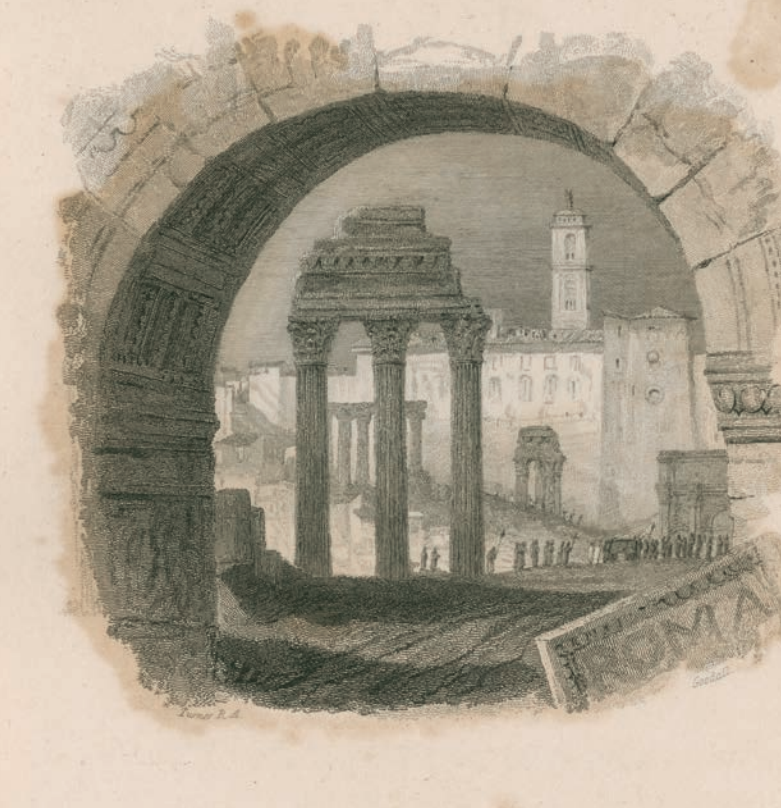
Engraving of the Roman Forum, Rome, from a drawing by JMW Turner, in Samuel Rogers' Italy: a poem . Special Collection PR 5234.19