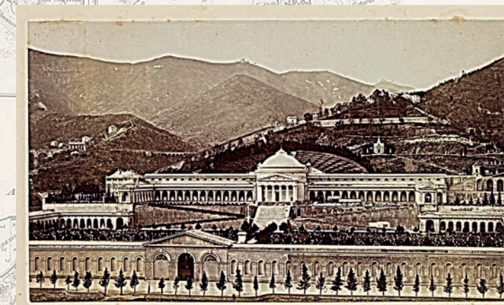
Photograph of Staglieno cemetery, Genoa, Italy, from an album of topographical photographs associated with Prince Leopold, 1st Duke of Albany, c1884. Manuscript collection MS 317