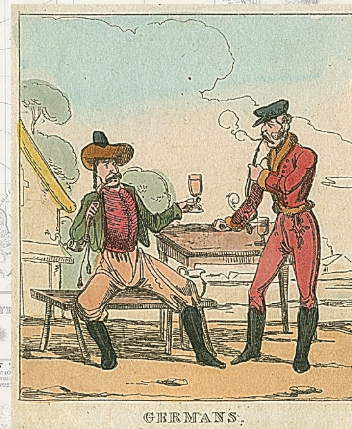
'Germans' from The World in Miniature (London, 1825). Briggs Collection LT210.C/W6

GRAND TOURISTS AND OTHERS TRAVELLING ABROAD BEFORE THE 20TH CENTURY