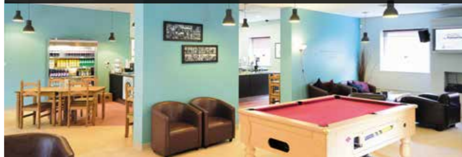
The cafe and communal area at Broadgate Park, which offers modern self-catered accommodation.