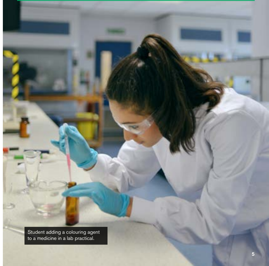
Student adding a colouring agent to a medicine in a lab practical.

We offer students the chance to apply to spend a semester or a year studying at our campus near Kuala Lumpur, Malaysia. For more information about studying abroad, please see page 17.