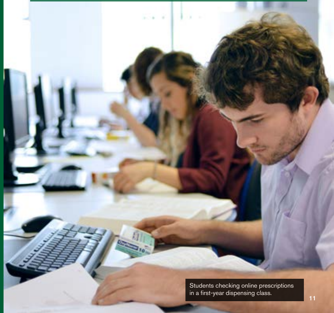
Students checking online prescriptions in a first-year dispensing class.

For Nottingham's KIS data, please see individual course entries at: www.nottingham.ac.uk/ugstudy