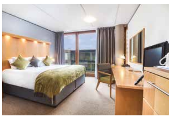
The Jubilee Hotel and Conferences Centre Double Hotel Room