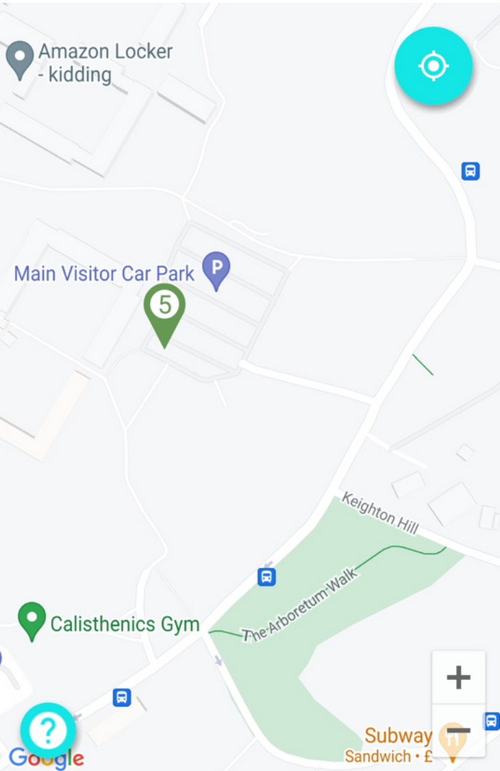
Main Visitor Car Park (next to Sir Clive Granger building)

Mer reference numbers: MER-FS-AD02120, MER-FS-AD02119, MER-FS-AD02122, MER-FS-AD02123, MER-FS-AD02284