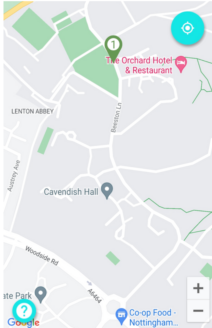
Beeston Lane (near David Ross Sports Village)

Mer reference numbers: MER-FS-AD02120, MER-FS-AD02119, MER-FS-AD02122, MER-FS-AD02123, MER-FS-AD02284