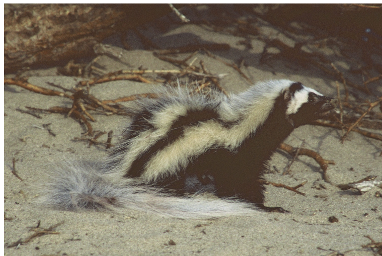
Plate 1: Ictonyx striatus erythrae , Wadi Adaldeib, Gabal Elba area.