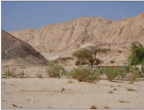
Plate 2. Ain Hodra © Matthew White