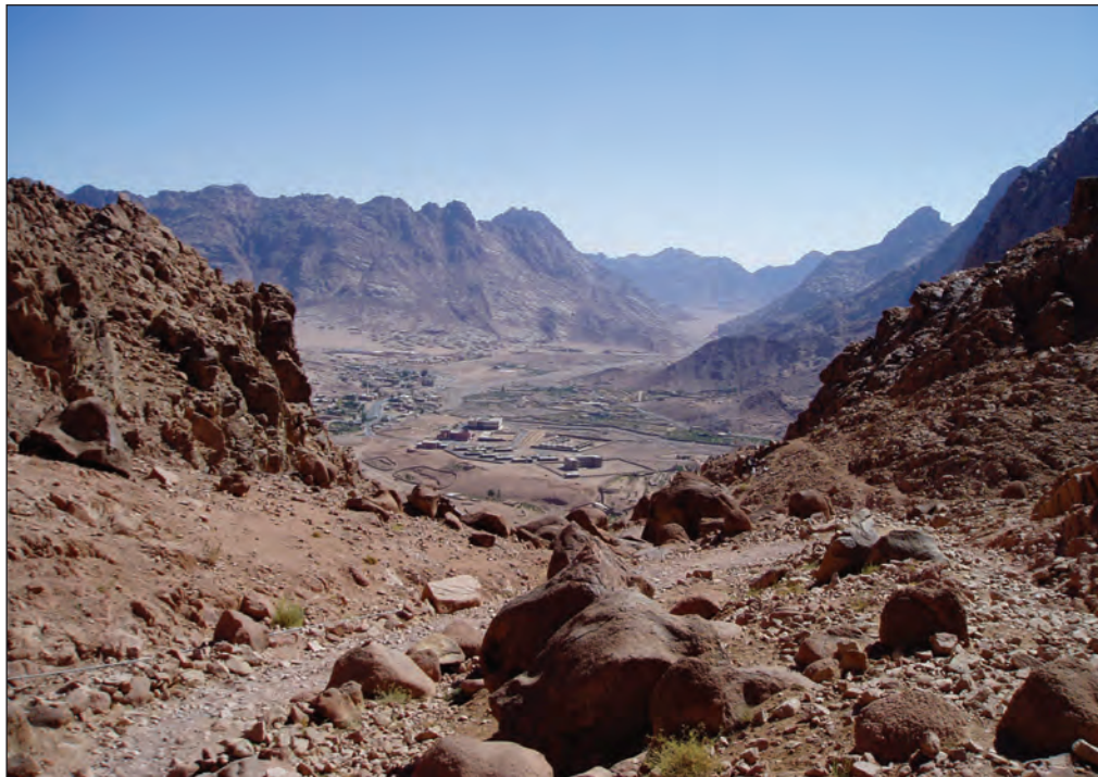
Plate 1. St Katherine City

Key: 2006: 1 = Wadi Nasb, 2 = Ain Hodra, 3 = Wadi Marra, 4 = Wadi Gharba, 5 = Wadi Gebel, 6 = Wadi Itlah. 2007: 7 = Ain Hodra, 8 = Sheikh Awad area (Wadi Sulaf), 9 = Wadi Kid, 10 = St Katherine City (2006 & 2007)