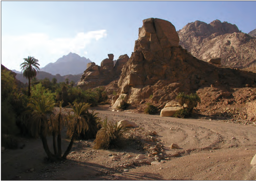
Plate 4. Wadi Kid

Wadi Itlah (1400–1520 m asl, 2006). Located close to St Katherine, Wadi Itlah is a narrow and long wadi system with scree slopes and extensive boulder fields. There are several Bedouin fruit gardens and small holdings with goats, sheep and donkeys, also a few carob trees and date palms outside of the gardens.