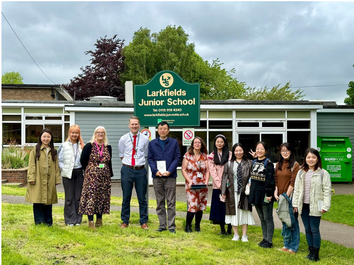
(ECNU delegates with the Head Teacher and staff from Larkfields Junior School.)

Thank you to all UoN staff and students and UNESCO Chair members who have contributed to the academic exchange week and have impressed the delegates from ECNU. The feedback was highly positive, both on the week and on the wider UoN community. ECNU delegates really appreciated the atmosphere they felt while at UoN and the School of Education - friendly, supportive, collegial, and engaging; which we have been working hard on as a school/university and it's been seen as obvious by visitors. The delegates were also impressed by the research culture we demonstrate, strong, international, and nurturing.