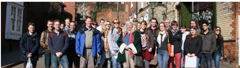
Staff and students in the Department of Archaeology on a field trip in Lincoln.