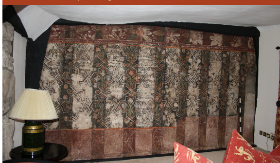
Uncovered wall paintings at the Saracens Head Hotel.

www.nottingham.ac.uk/archaeology/southwell