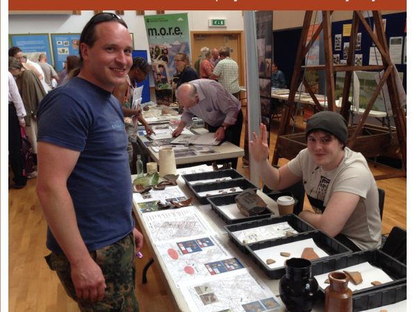
Students with the Southwell display at the community day.

Our students held a stall showing the results of our Southwell archaeology test-pitting project, with maps and finds on display. They also ran a whole range of activities for visitors, including artefact-handling sessions of Roman pottery, Saxon grave goods and medieval coins.