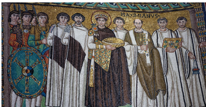
In this famous mosaic from the Basilica of San Vitale in Ravenna (AD547), Emperor Justinian is clad in Tyrian purple.