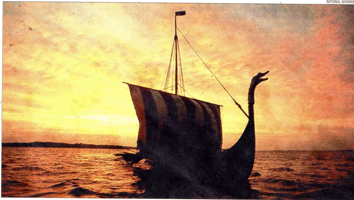
Experts believe that a Viking transport boat, the only intact one in Britain, is lying underneath a Wirral inn

"The only ones in the British Isles we know about — unfortunately