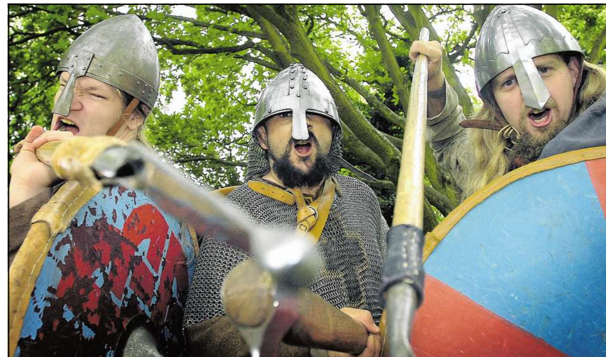
• Viking actors get ready to charge Code JM170710VIKING-4