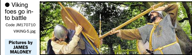
• Viking foes go in to battle Code JM170710 VIKING-5.jpg