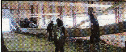
● Building of the ship under way in Norway

"The Dragon Harald Fairhair will be the largest Viking ship built in modern times, but in the Viking age that size would have been quite typical.