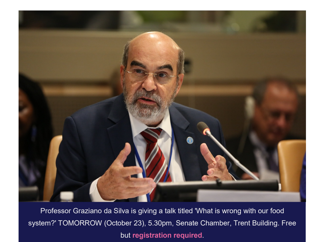
Future Food News