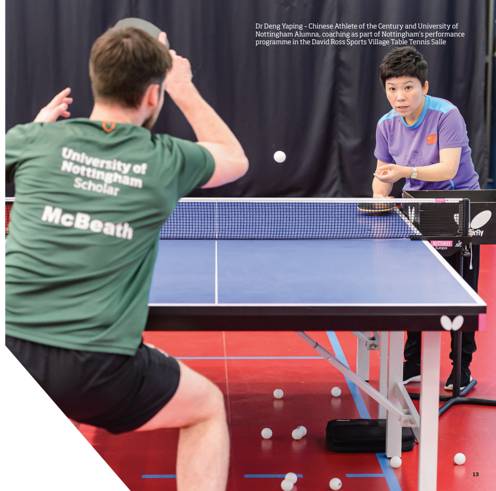
Dr Deng Yaping - Chinese Athlete of the Century and University of Nottingham Alumna, coaching as part of Nottingham's performance programme in the David Ross Sports Village Table Tennis Salle

Full sports science support and elite athlete testing services available including: body composition analysis, VO 2 max testing, balance and dynamic human motion capture analysis