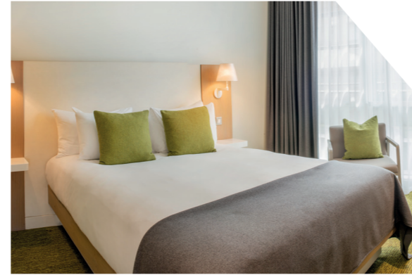
De Vere Orchard Hotel Double Room