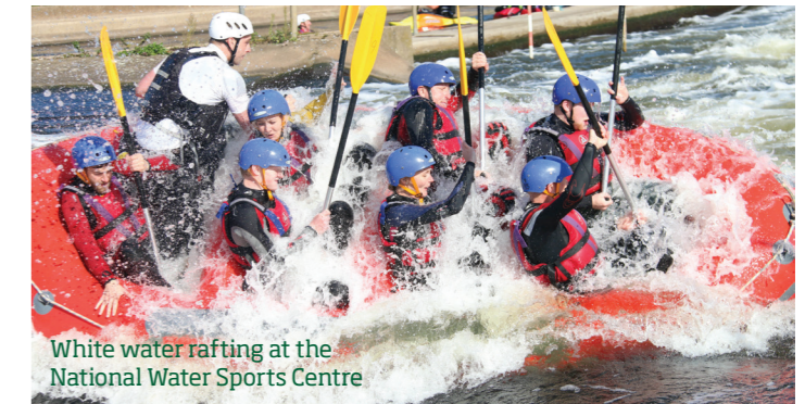
White water rafting at the National Water Sports Centre