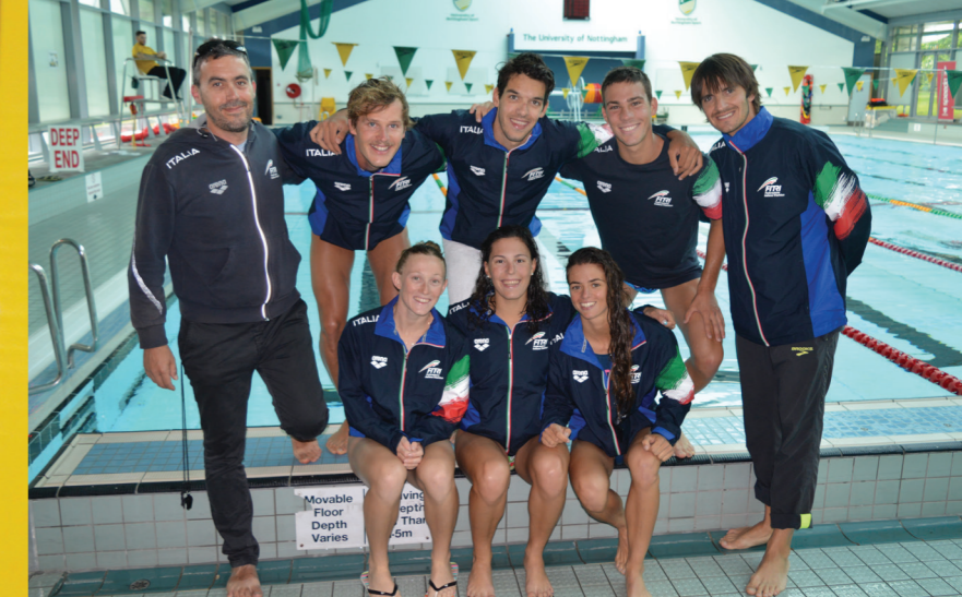
Italy team training ahead of the ITU Accenture World Triathlon Mixed Relay

“The University of Nottingham’s David Ross Sports Village has a fantastic range of facilities to cater for all of our needs. The staff have been instrumental in ensuring that our event runs smoothly and have consistently made our lives easier through their customer service and level of detail through the planning process. The facilities are clean, modern and have the ‘Wow’ factor for all visiting athletes and coaches.”