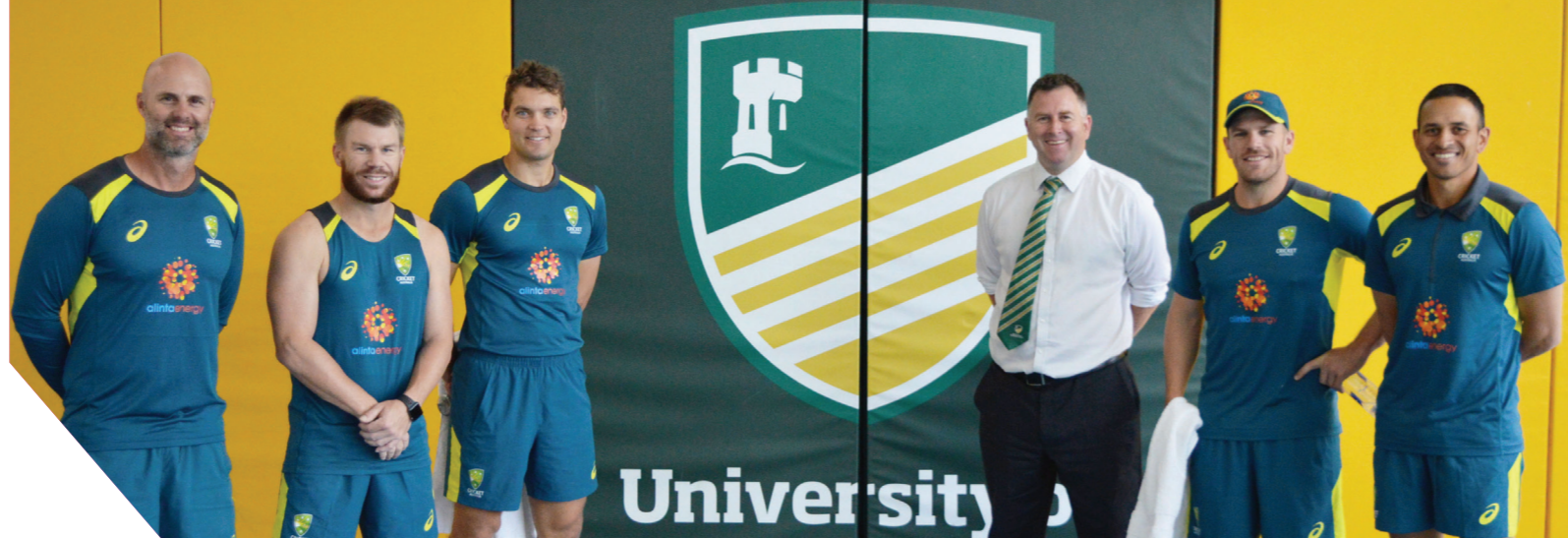
The Australian Cricket team in the High Performance Zone ahead of the ICC World Cup 2019