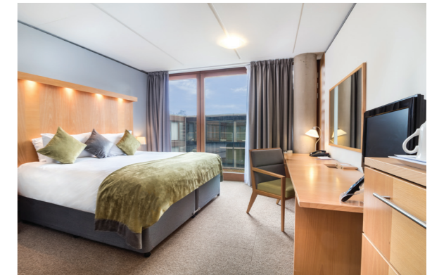
Jubilee Conference Centre Double Hotel Room