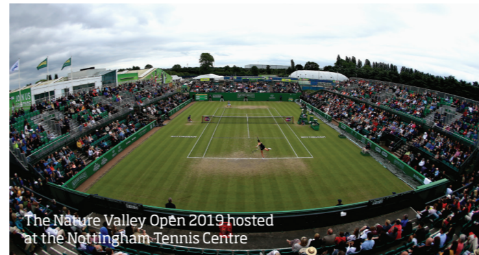
The Nature Valley Open 2019 hosted at the Nottingham Tennis Centre